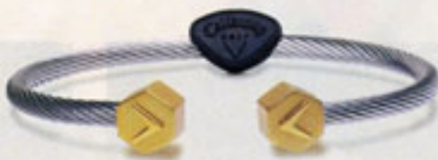
Callaway Golf link-style IONETIX bracelet, in stainless steel with magnets, $79.99.