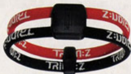
Trion-Z dual-loop magnetic ion bracelet with "patented Alternating North-South polarity," $19.99.