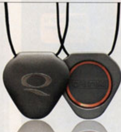
Q-Link SRT-3 two-sided pendant features a coiled wire inside a triangle, $99.95.